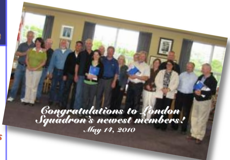
Congratulations to London Squadron's newest members! May 14, 2010